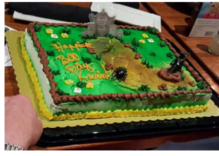
Just happened to be Kevin's birthday!